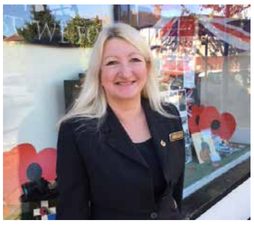
Offices pleased to support Remembrance Sunday 2017 Windows decorated and out on parade. Page 3