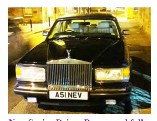
New Senior Driver Bearer and full time driver announced. Rob Lippitt spotted this appropriate car / number plate in Bakewell. Page 2